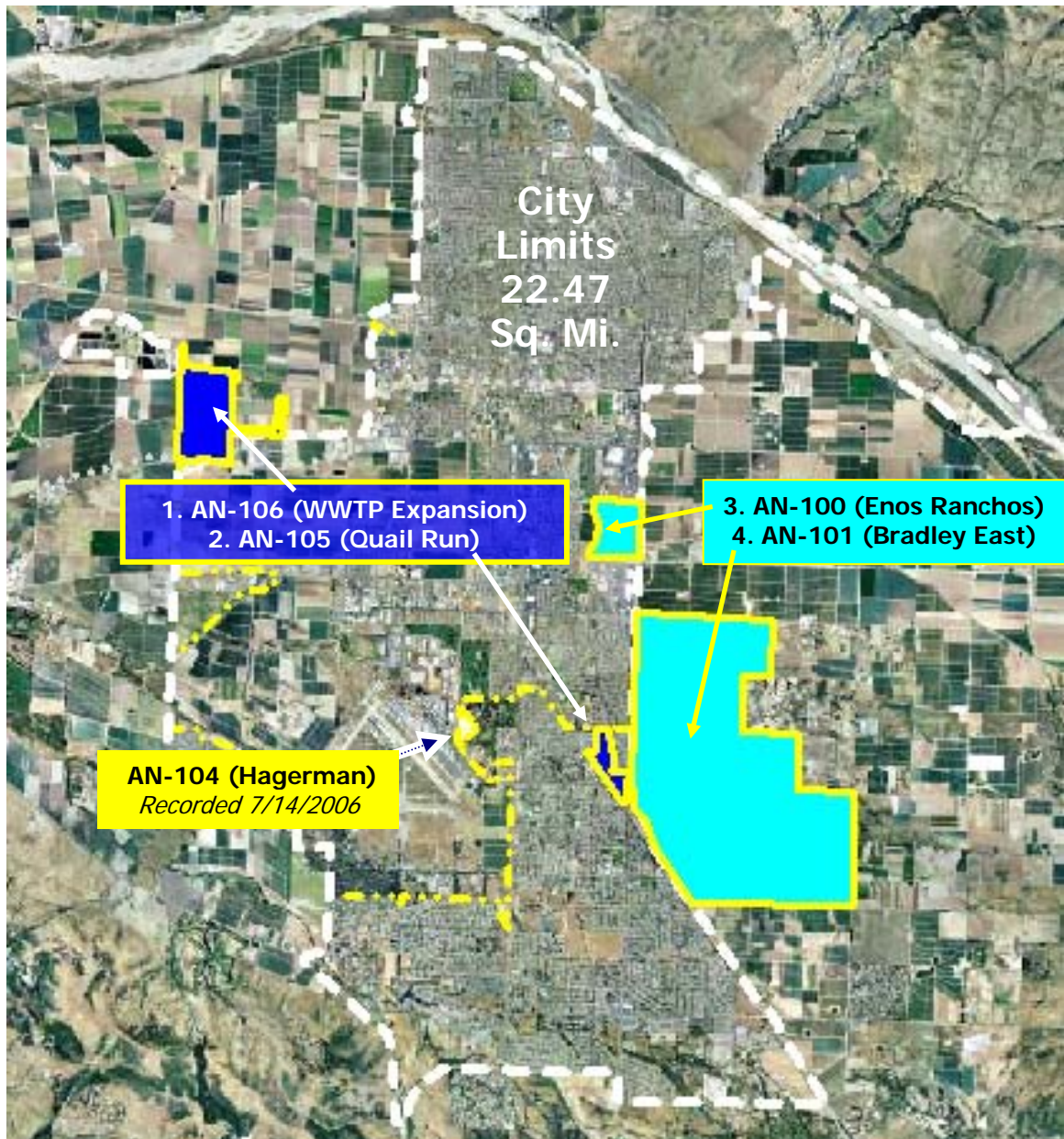
Aerial Photo showing the City of Santa Maria City Limits as of January 1, 2007

The aerial photo also shows four annexations (with blue shading and yellow outline) where the staff and applicants continue processing in 2006.